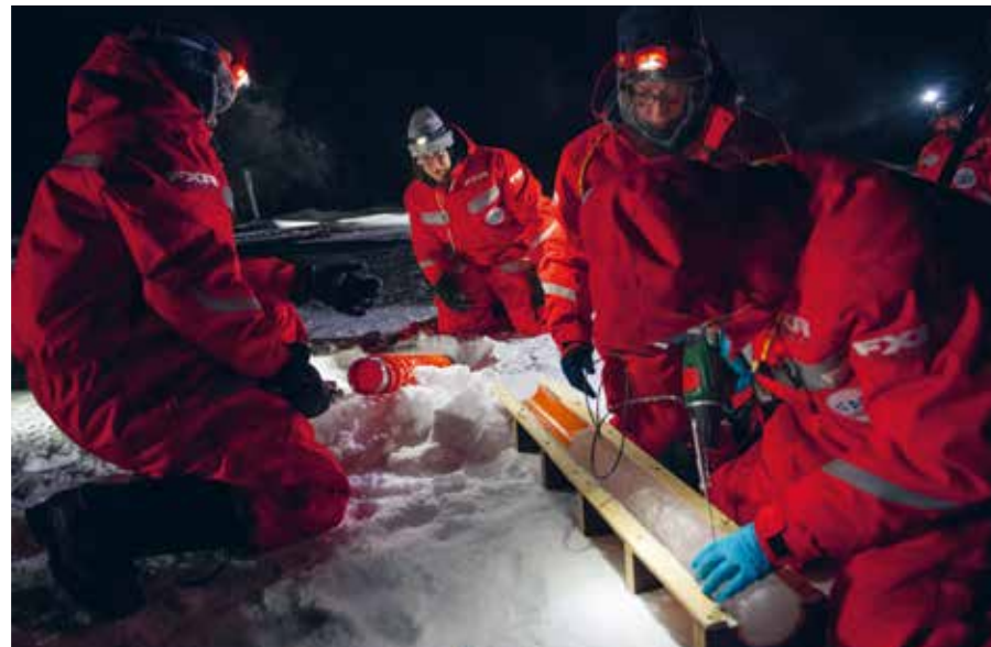
The sea-ice physicists weren't the only ones on the MOSAiC expedition to collect ice cores. Here, biogeochemists drill into a freshly collected core to measure its temperature.

Inspired by the discovery underneath the MOSAiC floe, the researchers then expanded their temperature analyses to include oceanographic time series from beyond the context of the expedition - and found frequent references to supercooling in surface water covered by sea ice. "But the temperature differences were so small that they were most likely written off as a measuring error, so no one took the time to investigate," says Katlein. "But we can now show that in our case, it definitely wasn't a measuring error. The biggest surprise was realising that there is a process underway in many parts of the Arctic that no one had ever truly noticed before."