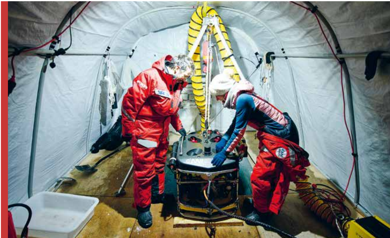
The AWI's ROV is hardly a lightweight: it takes the muscle power of two researchers to lower it into the water through the entry hole. A tent that was erected over the hole protects the sea-ice physicists from the wind and snow.