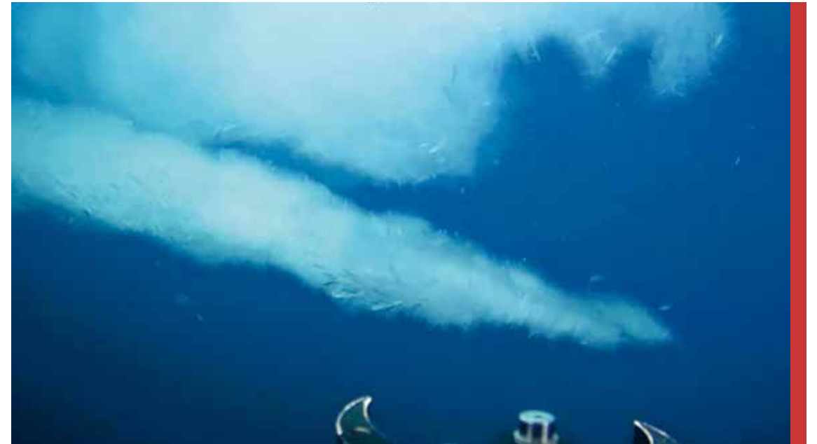
Platelet ice in the Arctic clearly differs from that in the Antarctic: for one thing, it doesn't form metre-thick layers; for another, it forms in the supercooled water on the underside of sea ice - and not at great depths below ice shelves.

In the Antarctic, platelet ice forms under the ice shelves , is pulled away from them by rising water masses and ultimately collects in five- to ten-metre-thick layers below the sea ice. Since some of the wafer-thin platelets grow into the underside of the sea ice, when researchers conduct crystallisation tests on Antarctic floes, they can recognise the platelet ice in the sea ice's structure. However, in the ice samples taken from the MOSAiC floe, Christian Katlein and his colleagues found no trace of the platelets; even tests run in the on-board laboratory didn't yield any clear evidence.